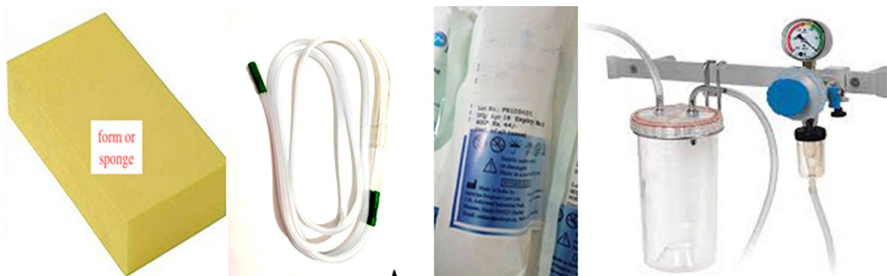
Fig. 2: Locally available material or device to assemble VAC therapy

satisfactory, economical, and without complications when cases are selected properly.