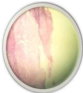
Fig. 1: Scanner view revealing vacuolated cells, with clear cell changes, solid microcystic variant of acinic cell carcinoma.

Diagnosis of this lesion can be misleading at times, due to its resemblance to the normal parotid tissue. 2 This tumor presents itself in a variety of histological patterns like Acinar-lobular, microcystic, follicular, papillary, cystic, medullary, ducto-glandular, primitive tubular. A panel of tumor markers like CK7, CD56, CD57 and so on can be used in immunohistochemistry for the diagnosis of acinic cell carcinoma (Fig. 1).