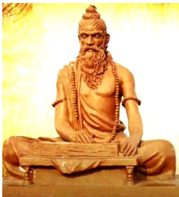
Fig. 1: Acharya Sushruta

Chikitsa , Volume Three- Kalpa and Uttara Tantram. Sushruta took surgery in medieval India to admirable heights and that era was later regarded as "The Golden Age of Surgery" in ancient India. Because of his numerous seminal contributions to the science and art of surgery in India, he is regarded as the 'Father of Indian Surgery' and the 'Father of Ancient Plastic Surgery'. According to him, the one who practices medicine after learning science from a preceptor and engages constantly in recapitulating it, can be called a physician whereas all others are imposter. 1 A complete review of Sushruta Samhita reveals the concepts and contributions of Acharya Sushruta in the field of surgery. Here are some of the contributions of this great surgeon towards the fascinating field of surgery.