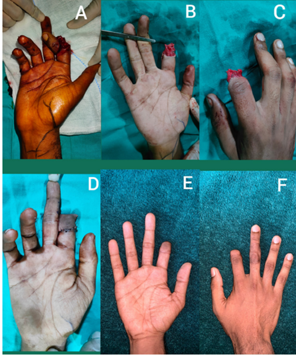
\ensuremath{\mathrm{A/B/C}} – Replant not attempted as no useable veins were found distally intraoperatively

One patient with near total amputation with