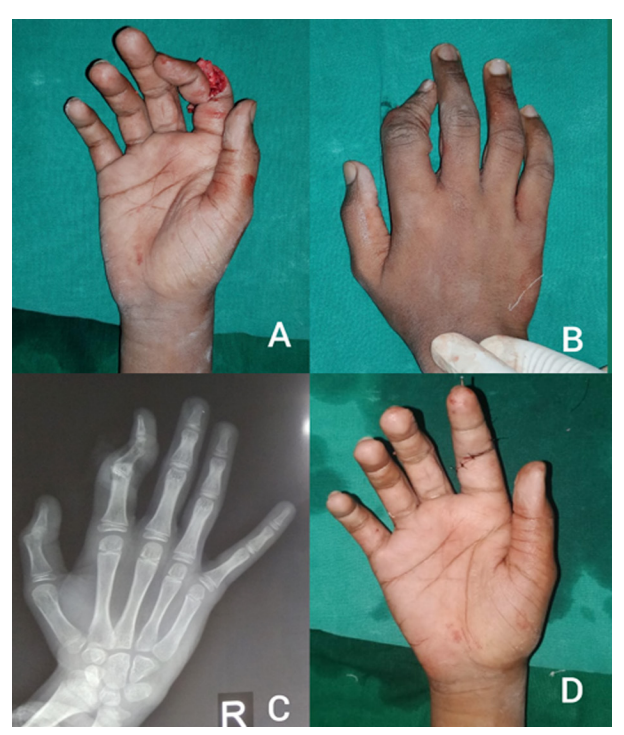
Fig. 3: A/B- Near total amputation of index without vascular compromise