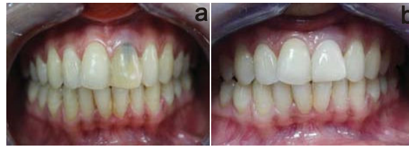
Fig. 4:(a) Pre-operative photograph, (b) Post-operative photographafter crown cementation.