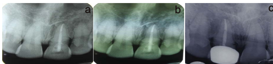
Fig. 3: (a) Post-operative IOPA, (b) Follow-up IOPA after 3 months, (c) Follow-up IOPA after crown placement