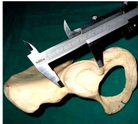
Fig. 2: Showing measurement of diameter of the acetabulum by vernier calliper.

Diameter of acetabulum Maximum transverse diameter of the acetabulum was measured using vernier callipers.