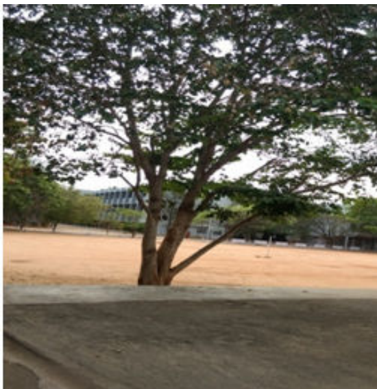
Plate-2: Study Area.