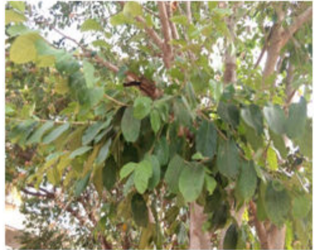
Plate-3: Habit of Holoptelea integrifolia .

The seeds of Holoptelea integrifolia were collected for the present study. Holoptelea integrifolia , Planch. selected in Nirmala College campus to find out the qualitative phytochemical and minerals analysis of the seeds of Holoptelea integrifolia were analysed. Seeds were collected during the month of April. The data were then processed and represented in tables and chart.