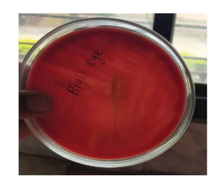
Fig. 1: On blood agar beta hemolysis, i.e. partial hemolysis was observed

On the basal agar, i.e. Brain heart infusion agar white mucoid, sticky colonies were grown after a period of 24 hrs. When further streaked on blood agar beta hemolysis was noted (Fig 1). Moraxella bovis produces partial hemolysis on the blood agar confirming the presence of the bacteria.