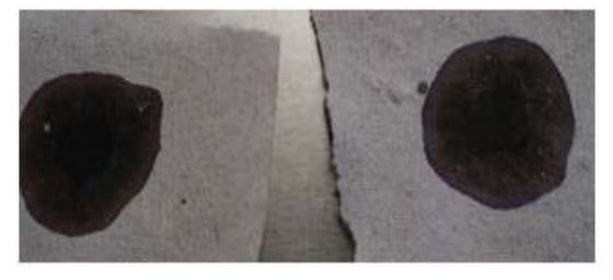
Fig. 4: Oxidase test-production of indophenols