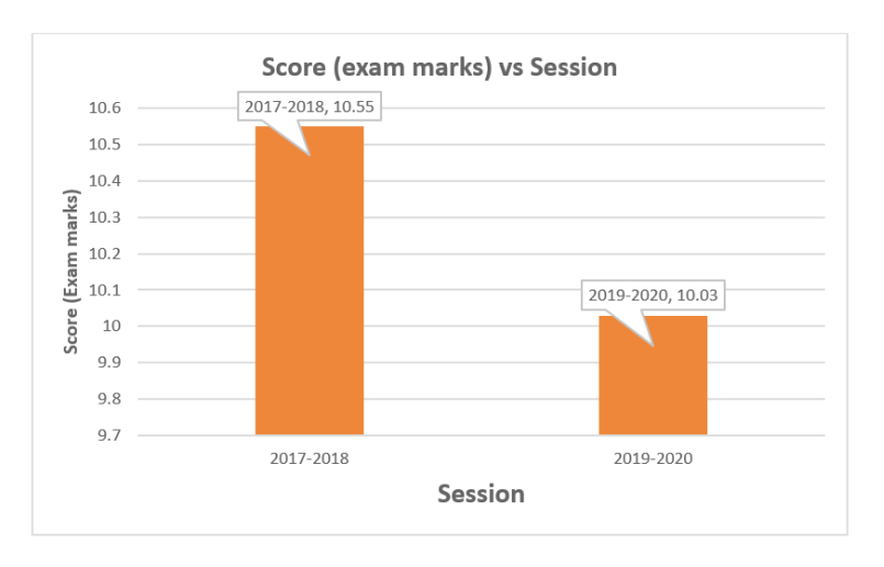
Fig. 1: (a) Comparison of the scores under old "5<sup>th</sup> year" and new teaching methods "3<sup>rd</sup> and 4<sup>th</sup> years". (b) Score shifting from 3<sup>rd</sup> to 5<sup>th</sup> year under old teaching methods. (c) Score shifting from 3<sup>rd</sup> to 4<sup>th</sup> year under new teaching methods.

Testing was repeated on the same students who