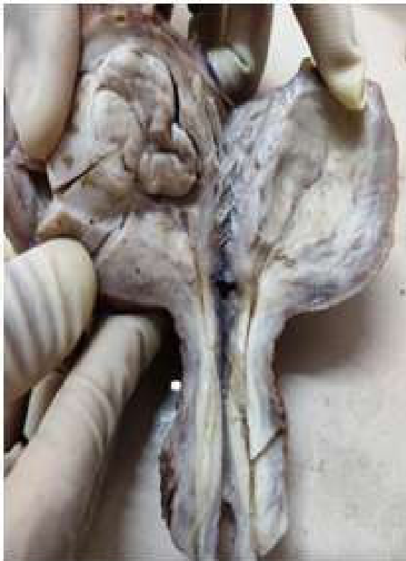
Fig. 1: Uterus cutopen showing intramural location of tumor-leiomyoma