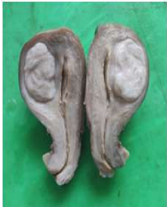
Fig. 3: Cut section of tumor grey white, circumscribed intramural location