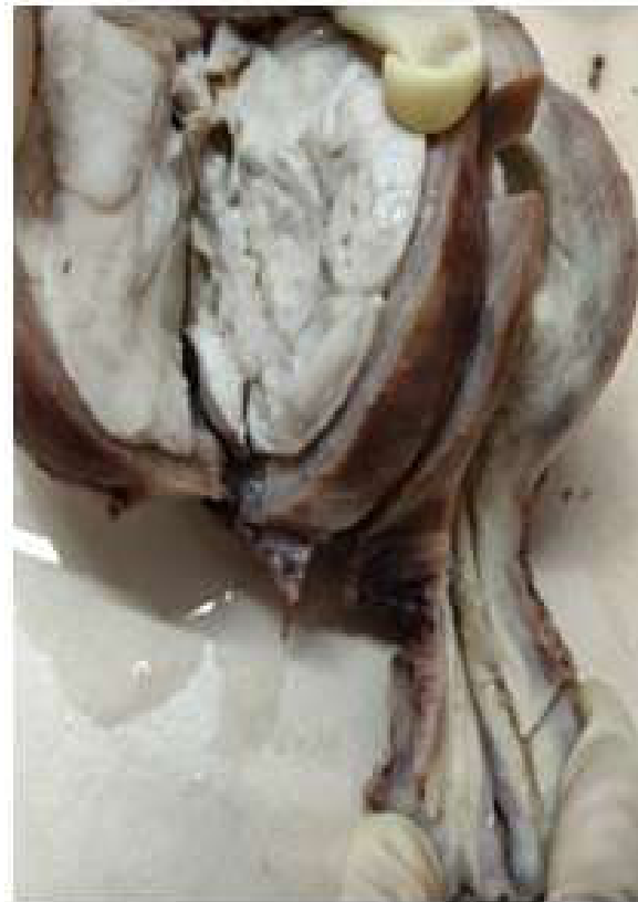
Fig. 2: Cut section of tumor grey white, circumscribed intramural location