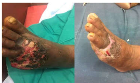
Fig. 2: A diabetic patient was accomplished by utilizing conventional modalities including a course of hyperbaric oxygen therapy.

peri wound TcPO 2 levels more are the chances of wound healing. It was observed that correlations individually were very significant in group of HT whereas it was not significant in group CT.