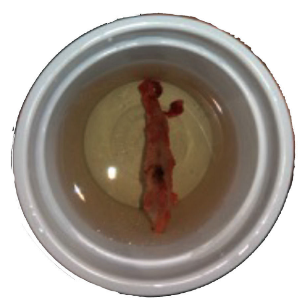
Fig. 1: Shows the excised bony twig of 1 cm in diameter and 5 cm in length

A 45 year-old Syrian male patient was undergoing a reversal of a colonic stoma, which was constructed during an earlier Hartmann's colectomy for a perforated sigmoid cancer. At the time of closing the midline laparotomy incision, the operating surgeon was unable to pass the suture needle through the left limb of the incision's upper angle. He reported a gritty resistance to the needle's tip and felt a hard oblong mass when he palpated the area. The operator decided to explore the lesion by incising the tissues overlyingit, which revealed a bony twig of 1cm in diameter and 5 cm in length. The bone had a caudal free rounded end embedded in the left rectus abdominis muscle. The surgeon proceeded to dissect the bone, not knowing it's nature, cephalically, where it was found to join the sternum by a fibrous band. The bone was excised (Figure 1)