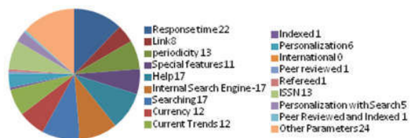
Fig. 1: Distribution of E-Newsletters by Parameter Coverage.

The table and chart shows that out of 24 E-Newsletters Good Response time 22 (90%), Help, Internal Search Engine, Searching 17 (70%), Periodicity 13 (54%), Currency and current trends 12 (50%), Link 8 (33%), Personalized 6 (25%), Search with Personalization 5 (20%), Refereed, Indexed, Peer Reviewed, Peer Reviewed and Indexed having 1 (4%). Rest Parameters have 24 (100%)