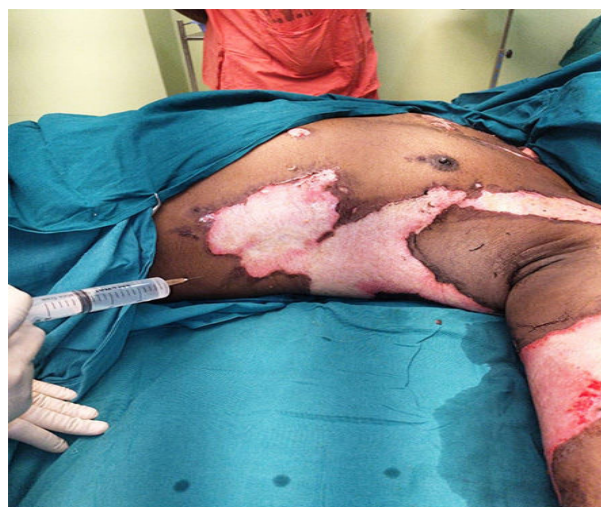
Fig. 1: Wound with BJWAT Score 32 at admission