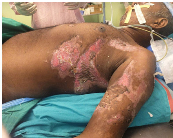
Fig. 2: BJWAT Score 15 after treatment and skin grafting