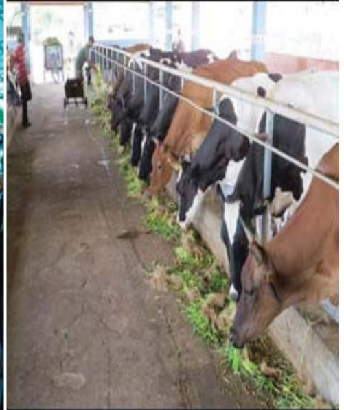
Pic 4. Feeding of Hydroponic maize fodder