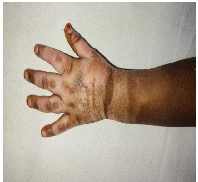
Fig. 4: Healed dorsum of hand