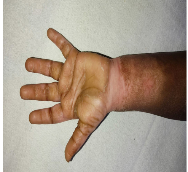
Fig. 3: Healed palmar aspect of hand

The wound due to scald burns healed completely (Fig. 3,4). LLLT is found feasible as adjuvant modality of wound healing in scald burns.