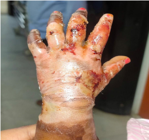
Fig. 1: At the time of admission

After debridement LLLT, (Fig. 2) was given to the burn area in each session. Gallium Arsenide (GaAs) diode red laser of wavelength 650 nm, frequency 10 kHz and output power 100 m W was used as a source of LLLT. It is a continuous beam laser with an energy density of 4 J/cm 2 . Machine delivers laser in scanning mode (non-contact delivery) with 60 cm distance between laser source and wound. In each session, the wound was given laser therapy for duration of 125 second followed by non-adherent dressing. Regular LLLT was given once every three days for a total of 6 session. It was also supplemented with various modalities like prolotherapy, autologous platelet rich plasma, insulin therapy