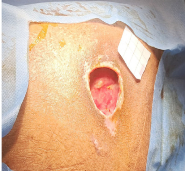
Fig. 2: Right trochanteric injury after 3 weeks of treatment with stage reduced from

stage D (3+); IS (3+); PS (0); RC (4) to stage D (3); IS (2+); PS (2); RC (4)