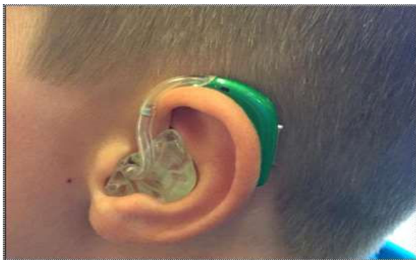
Fig. 1: Hearing device