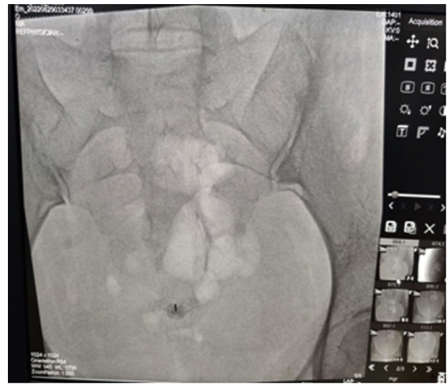
Fig. 1: Needle position in AP view

A solution of 1% lignocaine 3ml was then injected