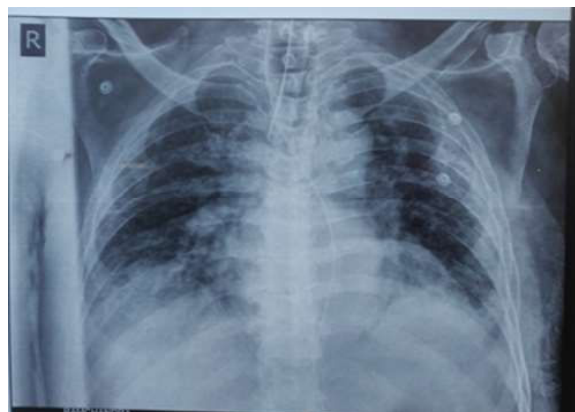
Fig. 1: X-ray

CECT scan (Fig. 2) showed small areas of honey combing suggesting early changes of interstitial pulmonary fibrosis, trachea-bronchomalacia. An