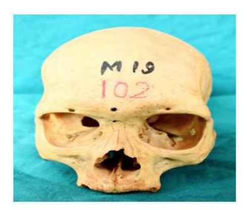
Fig. 2: Bilateral Supraorbital Foramen.