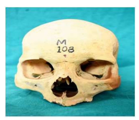
Fig. 1: Bilateral Supraorbital notch.