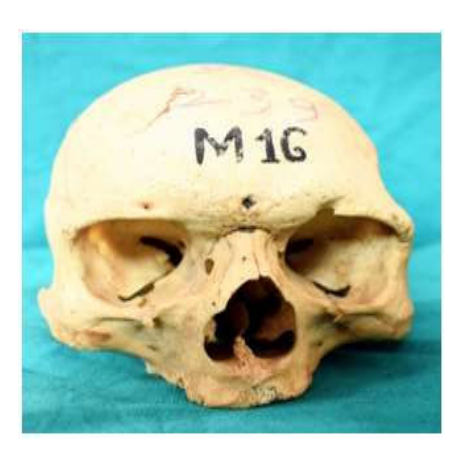
Fig. 3: Unilateral Supraorbital Foramen on right side.