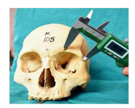
\label{eq:Fig.5} \textbf{Fig. 5:} \ \textbf{Measurements of distance between FZS and SON/SOF.}