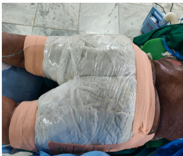
Fig. 3: Application of negative pressure wound therapy to enhance the wound healing and graft uptake