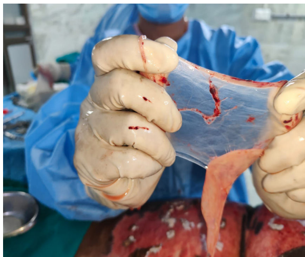
Fig. 1: Amniotic membrane which was harvested from human placenta

Throughout both the intraoperative and postoperative phases, the patient experienced no notable events. Upon opening the dressing on the seventh day post-operation, substantial areas of re-epithelialization and healing were observed. Complete healing of all second-degree superficial burn wounds was achieved without any complications or adverse effects noted throughout the entire procedure. BJWAT wound score improved from 48 at presentation to 32 after utilization of amniotic membrane regenerative therapy. (Fig. 4,5)