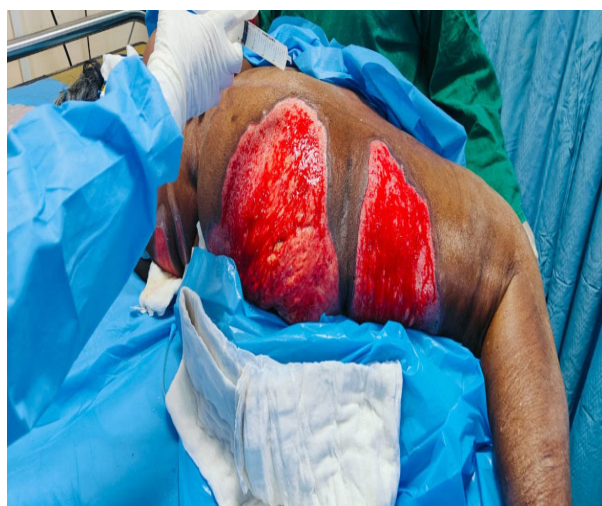
Fig. 5: Condition of the wound after utilization of amniotic membrane regenerative therapy (BJWAT wound score - 32)