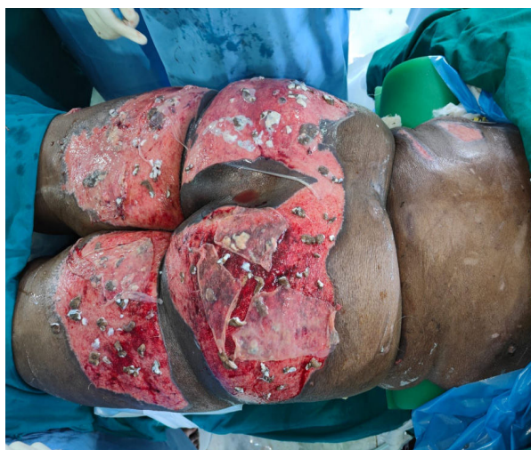
Fig. 2: Amniotic membrane which was harvested from human placenta being applied over the wound over the gluteal region