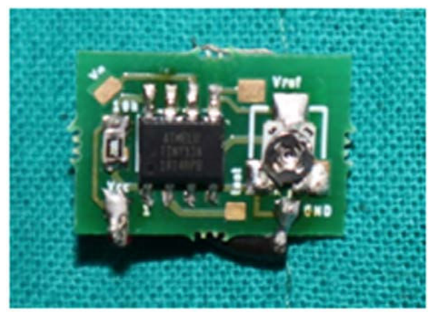
Fig. 1a: Assembled sensor

This is the part of the device which will sense whether patient is wearing the appliance or not. In order to resolve short coming in the existing thermal sensors as mentioned above, infrared proximity detection is chosen as a method of sensing. It has a footprint of 1 cm x 1.5 cm (Fig. 1a, 1b). This is also equipped with a coin battery of diameter 1.5 cm. Since the set acrylic is hard and translucent we have used the infrared proximity detection sensor embedded inside the acrylic for the sensing purpose. As the patient wears the appliance embedded with the sensor, Infrared (IR) light reflected from the surface of mucosa can be detected and it can thus be used to count the wear time of appliance for the patient.