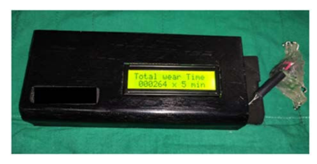
Fig. 2a: Receiver with displayed wear time

It is responsible for the detection and display of wear time data obtained from the sensor. It is a one time hardware and can read data from any sensor. The receiver is equipped with a LCD screen along with buzzer which gives an audio cue to the person extracting data from the sensing device. Receiver is also provided with replaceable batteries (Fig. 2a).