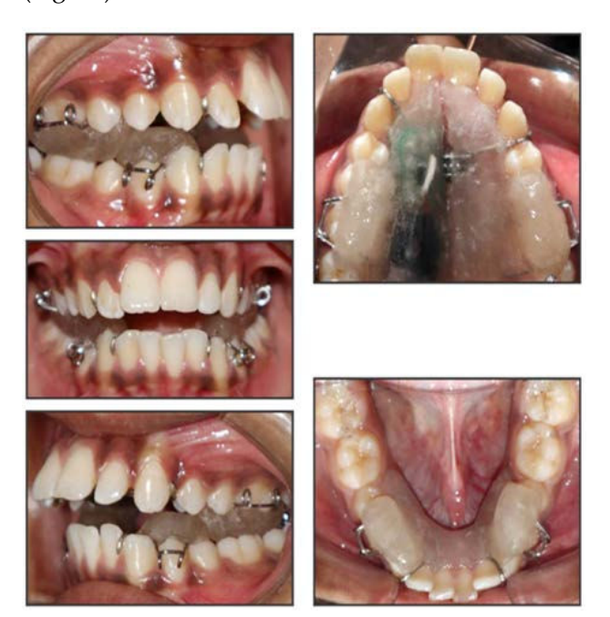
Fig. 3b: Patient wearing twin block appliance with electronic timing device embedded within acrylic of upper plate.

Informed consent of the parents was obtained for electronic assessment of wear time. Twin Block appliance was constructed with electronic timing device (sensor) embedded within the acrylic of upper plate to assess the wear time of appliance (Fig. 3b).