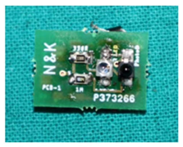
Fig. 1b: Assembled sensor

A minor modification on the working model is made by painting a non-reflective black paint on the palatal surface. The patient is instructed to keep the appliance on the modified working model