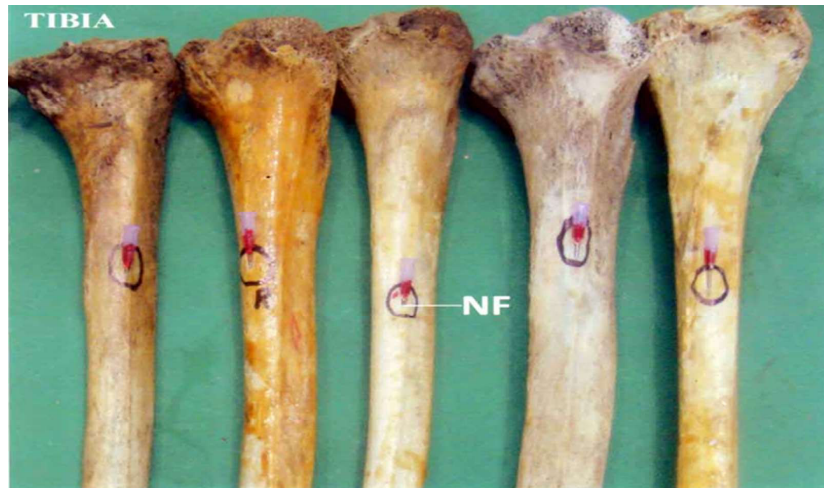
Fig. 2: A photograph of the posterior surface of right tibiae showing a single nutrient foramen (NF). The foramen is located in the proximal third (Type 1) and is directed downward.

The single fibula nutrient foramina (1.9%) were located in the distal third of the bone, while 3.7% had nutrient foramina in the upper third. These results were in agreement with most of the previous studies (Mysorekar, 1967; Mckee et al., 1984; Forriol Campos et al., 1987; Sendemir and Cimen, 1991; Gumusburun et al., 1994; Collipal et al., 2007). 2,5,8,19,20,24 On other hand, Guo (1981) 10 reported that the majority of foramina were located in the proximal third of the fibula.