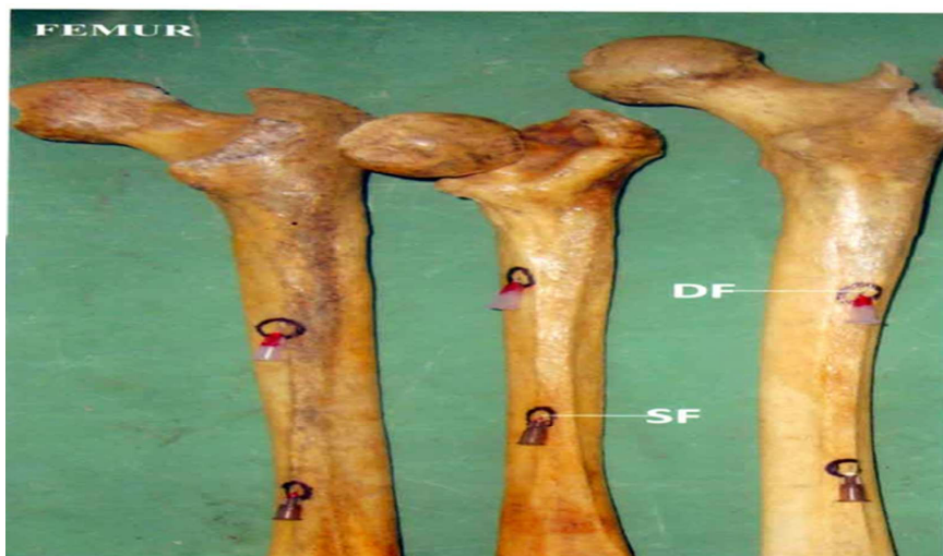
Fig. 1: A photograph of the posterior surface of right femora shaft showing double nutrient foramina (NF). Both foramina are directed upwards as shown by the needles inserted.

In the present study, most of the nutrient foramina in the tibiae were in the proximal third 88%. Nutrient foramina were located in the middle third in the rest of the tibiae examined (12%). 94% of the foramina were on posterior surface out of which 47 were single dominant foramina. On the lateral surface 6% of the foramina were seen out of which 3 were dominant single nutrient foramina. There were no foramina in the distal third. Similarly, many authors reported