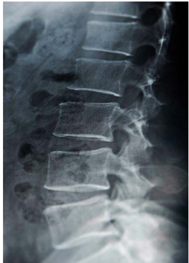
Fig. 1: lateral x-ray of the lumbo-sacral spine showing straightening (loss of natural lumbar lordosis).

The patient revisited the ED within 12 hours, complaining of excruciating low back pain radiating to both legs, and difficulty in micturition. Physical examination was notable for a positive Straight Leg Raise (SLR) test in the right leg, with right foot drop, and diminished