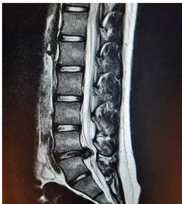
Fig. 2: T1 weighted mid-sagittal view of the lumbo-sacral spine showing L4-L5 disc herniation resulting in spinal cord compression. Sacralisation of L5 vertebra is also noted.

A rapid diagnosis by the Emergency Physician, and prompt surgical decompression by the Neurosurgeon saved the day for this adolescent.