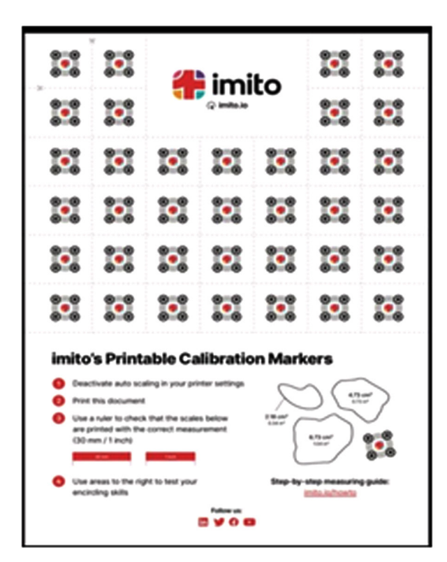
Fig. 1: Caliberation marker

Step 3: Calibration markers (fig. 1) are available in app and in websites which can be downloaded and taken printout. This calibration marker should be used while taking photo and in digital assessment of wound.