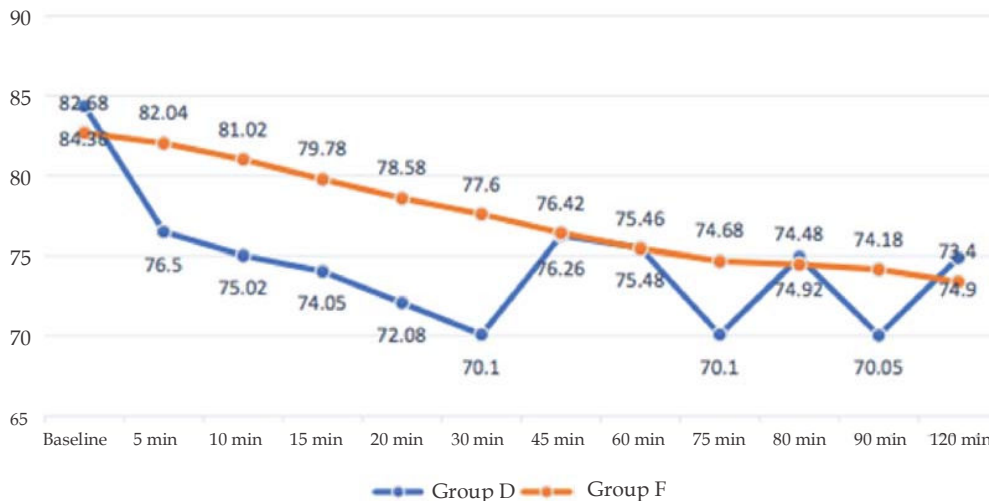
Fig. 1: Comparison of heart rate between two groups at various intervals

Shows distribution of pulse rate at various intervals between two groups and p value is statistically significant at 5 min, 10 min, 15 min, 20 min, 30 min, 75 min and 90 min (Fig. 1).