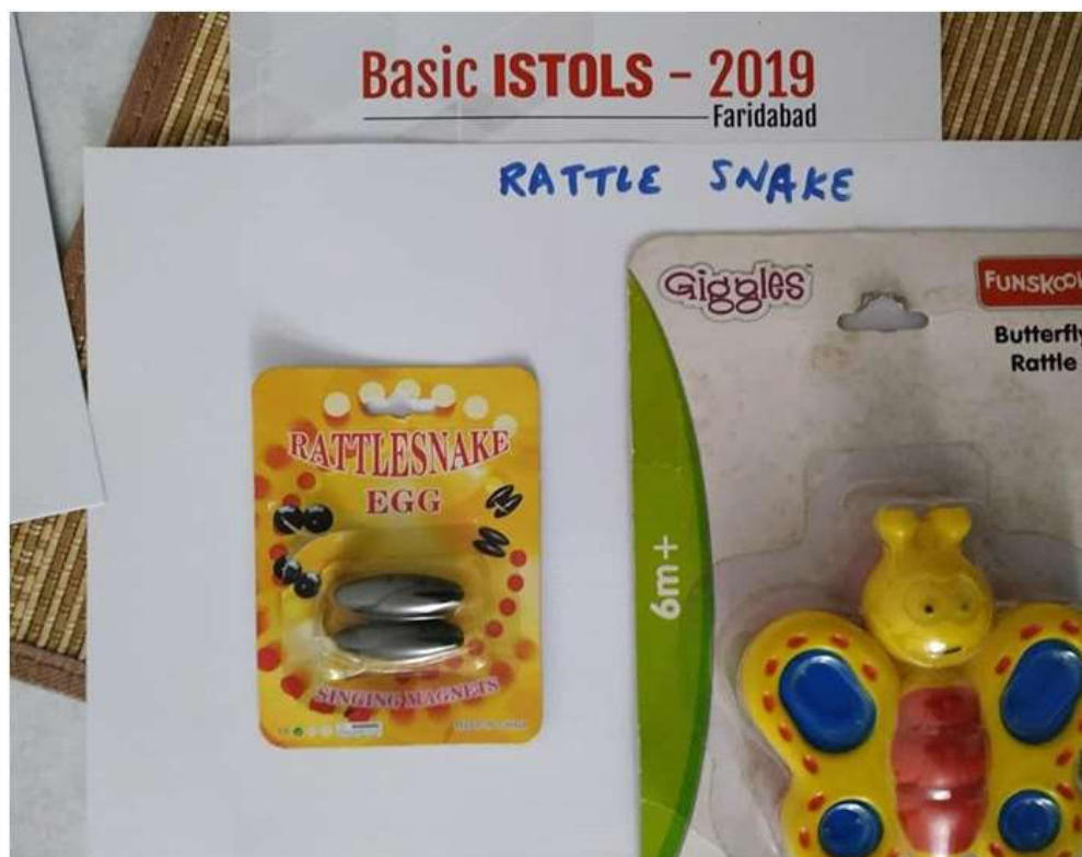
Fig. 7: Simulating rattling sound of rattle snake by colliding magnetic pellets and differentiating with death rattle in victim, simulated by rattle toy sound.

On 23rd March 2019, in Amrita Institute of Medical Sciences (AIMS), Poison control centre, Kochi, we have Bottom figure 7. Caption, add space to the bottom para below on page 71 medicine and toxicology. conducted ISTOLS workshop successfully by training 25 resident doctors, NRHM Rural Medical Officers of Kerala and consultants in critical care, emergency, forensic medicine and toxicology.