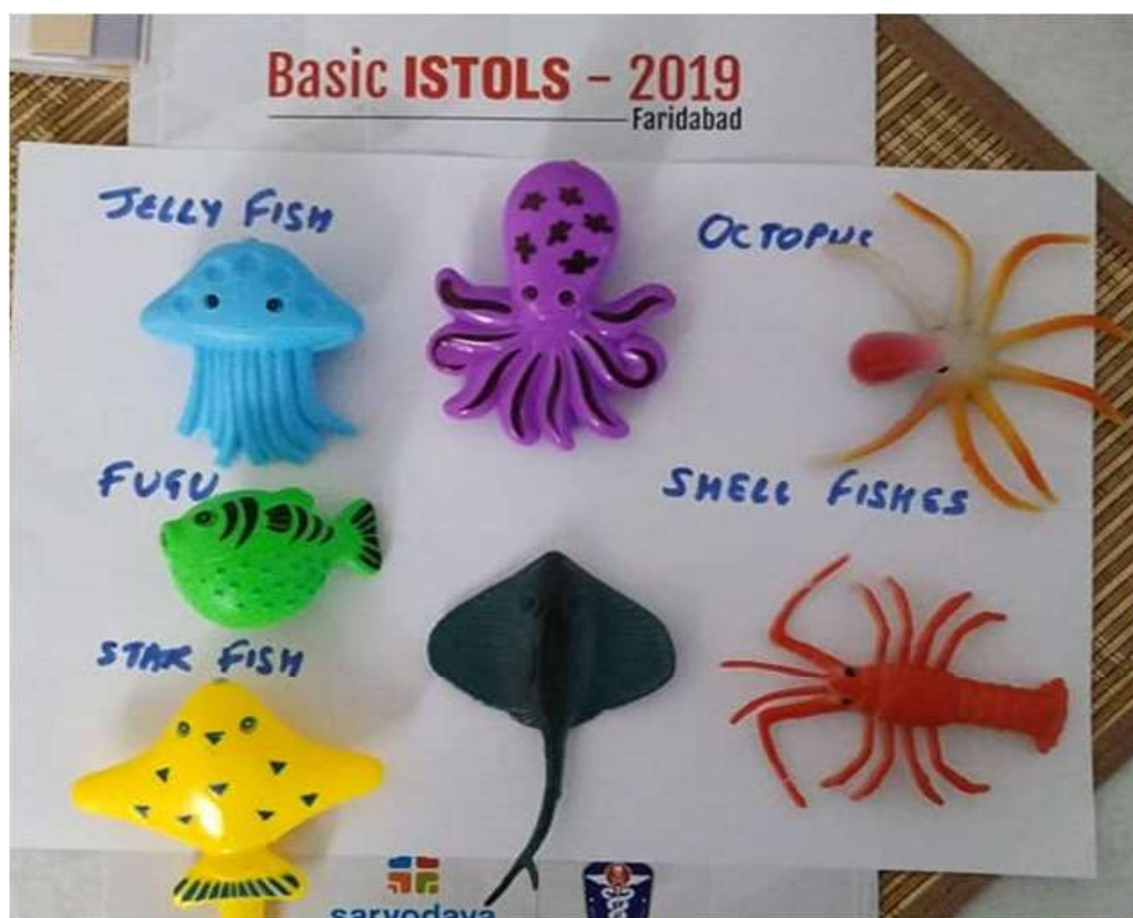
Fig. 5: Marine envenomation teaching by venomous fishes, Fugu, Sting Ray, Star fish with sting, Jelly fish with tentacles, Blue-ring octopus, shellfish and non-venomous Octopus, scenarios simulated by similar look alike toys, thus learning Toxicology in non-toxic manner

On 29th July 2019, in Sarvodaya Hospital, Faridabad, we have conducted ISTOLS workshop successfully by training 55 resident doctors, NRHM Rural Medical Officers of Haryana and consultants in critical care, emergency, forensic medicine and toxicology.