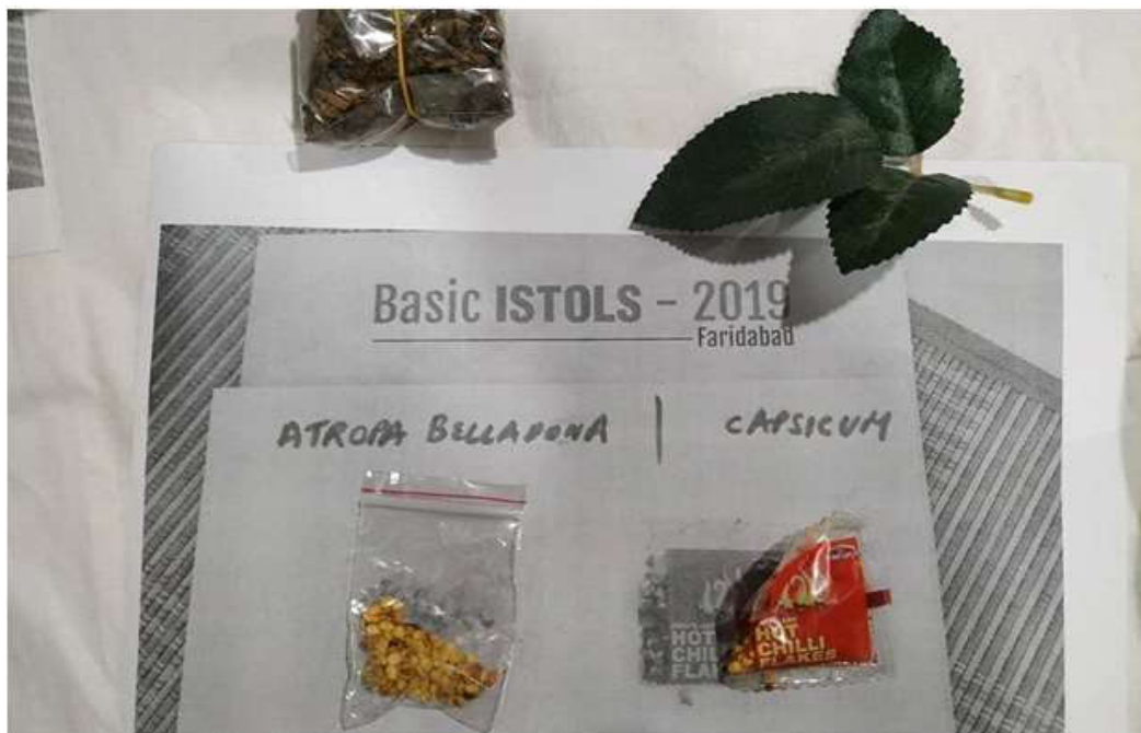
Fig. 2: Dhatura seeds simulation by chilli seeds.