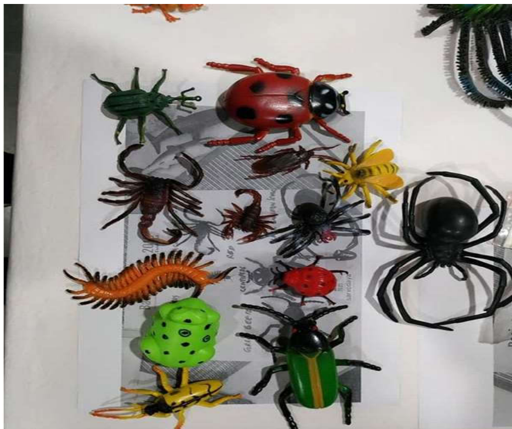
Fig. 3: Poisonous animals (Dart Frog) Venomous insects (Black widow spider, Scorpion, Red scorpion, Honey Bee, Wasp, Spanish Fly, Centipede, Tarantula), non-venomous (Common Spider, Cockroach, Red Beetle) of rubber used for simulation training including beetle, spider, scorpion and dart frog. Thus learning Toxicology in non-toxic manner.

On 21st November 2019, Similarly, we conducted ISTOLS in Grande Internationale Hospital, Kathmandu, Nepal successfully by training 34 resident doctors and consultants in critical care, emergency, forensic medicine and toxicology