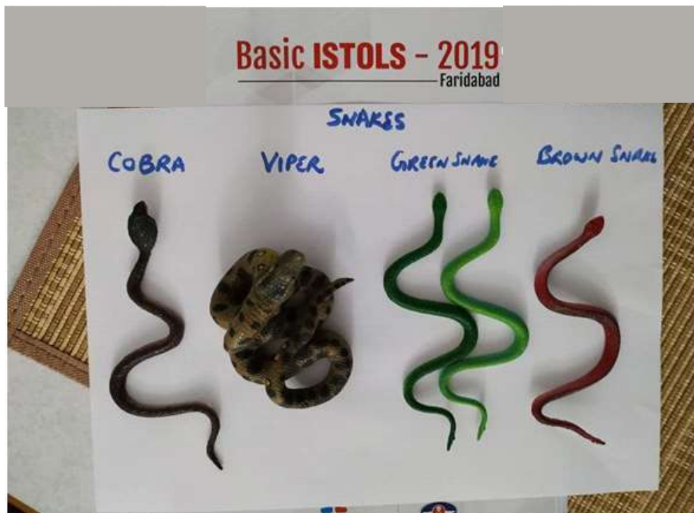
Fig. 6: Different Venomous Snakes for identifying 4 Toxidromes, by big 4, Cobra and Viper, and non-venomous Green Snake, Brown Snake; utilising look alike toys, thus learning Toxicology in non-toxic manner