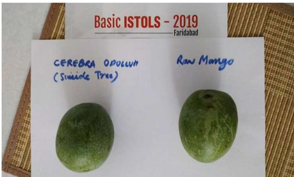
Fig. 11: Raw mango (from Garden) simulating look alike, Cerebra odollam suicide tree fruit. We took pre-test and Post-test for all the RMOs and observed during above mentioned ISTOLS trainings in States of Sikkim, Karnataka, Kerala, Haryana, Rajasthan, Uttar Pradesh and RMOs internationally, posted in our neighbour country Nepal that, Rural Medical Officers who received high fidelity training on a human patient simulator performed significantly better on the advanced life support, in written examination, in medicolegal documentation of right antidotes indicated to right patient, in right dose, frequency and by right route in right manner; as well as improved self-confidence of RMOs in handling mass casualties by toxic disasters during a mock resuscitation. Pre-test and posttest analysis reported improvement in overall performance by doctors after implementation of simulator training sessions. Figure No. 12. Bar Diagram showing impact of simulation teaching on participant's scores of Pre-test and Post-test by simulation training of RMOs