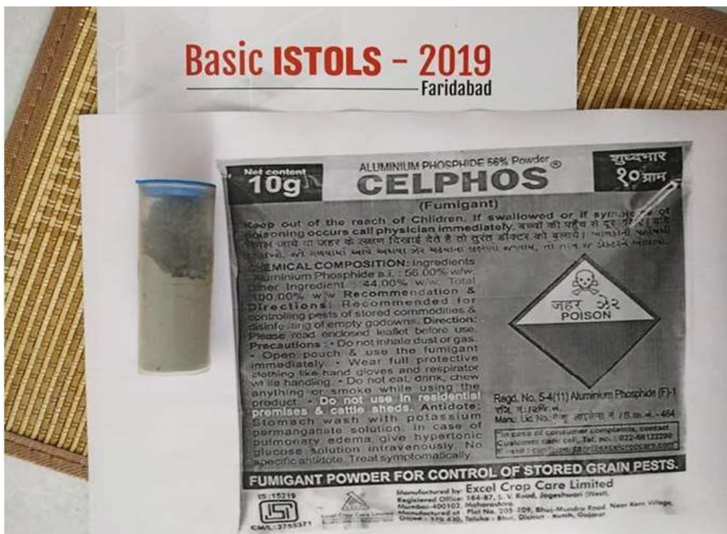
Fig. 10: Grey coloured cement powder simulating celphos powder of Aluminium phosphide. We have similarly conducted another ISTOLS on 7th April 2018 in SMIMSSikkim Manipal Institute of Medical sciences, Gangtok, Sikkim successfully by training 37 resident doctors in critical care, emergency, forensic medicine and toxicology, pharmacology, internal medicine and NRHM Rural Medical Officers posted in peripheries of Sikkim State.