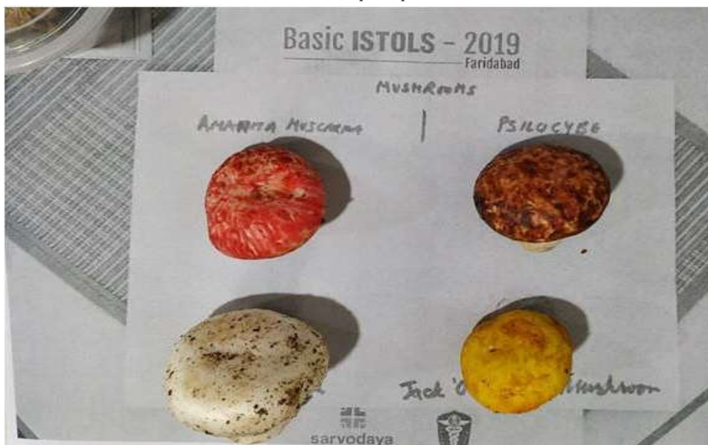
Fig. 1: Common Poisonous mushrooms, simulated by colouring the edible mushrooms with sketch pen to look alike Amanita, Jack O' Lantern, Psilocybe, thus learning Toxicology in non-toxic manner.