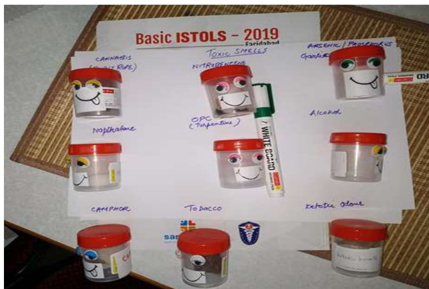
Fig. 8: Toxic smell simulation by common household substances, like shoe-polish (aromatic Nitrobenzene), Napthalene balls, Perfume scents (poison lily, jasmine), turpentine oil (Organophosphates), rotten egg (Hydrogen Sulphide), almond oil (Cyanide), Burnt Rope (Cannabis), Poppy seeds (Opium), Ketotic odour (fruit juice), Tobacco (snuff), Camphor, Alcohol (Handrub), Arsenic/ Phosphorus (actual Garlic bulb from kitchen garden). Last year, we have conducted ISTOLS course on 24th-25th June 2018 in Medanta-the Medicity successfully by training 21 resident doctors, NRHM Rural Medical Officers (RMO) of Haryana, Rajasthan and Delhi NCR consultants in critical care, emergency, forensic medicine and toxicology. On 13th January 2019, in Victoria Hospital, Bengaluru, we have conducted ISTOLS workshop successfully by training 55 resident doctors, NRHM Rural Medical Officers of Karnataka and consultants in critical care, emergency, forensic medicine and toxicology.