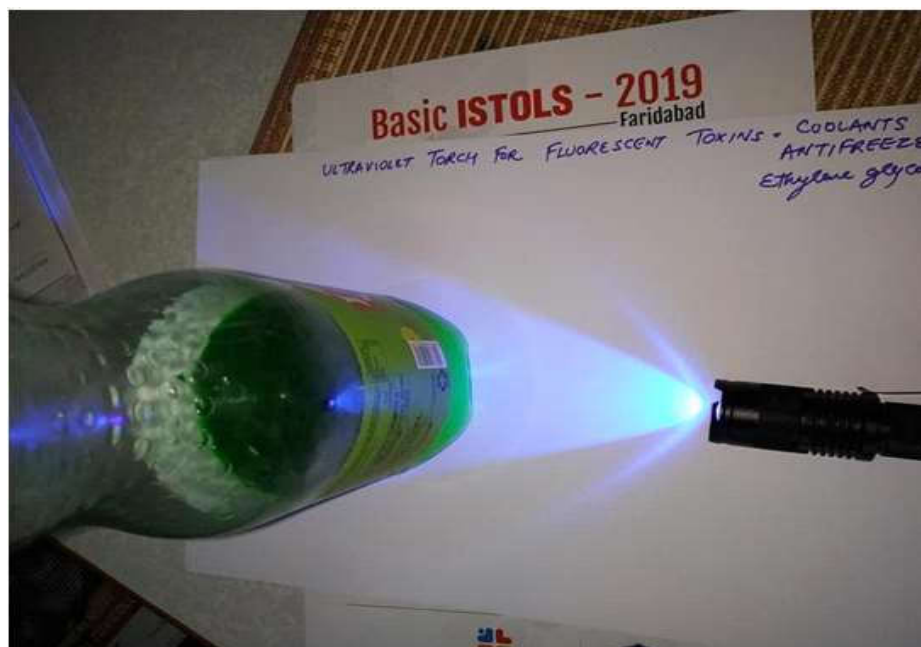
Fig. 9: Ultraviolet fluorescence of Car AC coolant- ethylene glycol- toxic alcohol (glows in UV torch) for on-spot diagnosis Last year, we have conducted ISTOLS on 24th-25th June 2018 in Medanta-the Medicity successfully by training 21 resident doctors, NRHM Rural Medical Officers of Haryana and consultants in critical care, emergency, forensic medicine and toxicology. Last year, we have conducted ISTOLS course on 24th-25th June 2018 in Medanta-the Medicity successfully by training 21 resident doctors, NRHM Rural Medical Officers (RMO) of Haryana, Rajasthan and Delhi NCR consultants in critical care, emergency, forensic medicine and toxicology.