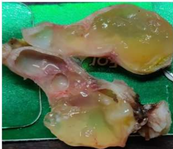
Fig. 3: specimen of mucocele appendix.

histopathological examination of appendectomy specimen. Carcinoid tumors are found in 0.3–0.9% of patients of appendectomy.