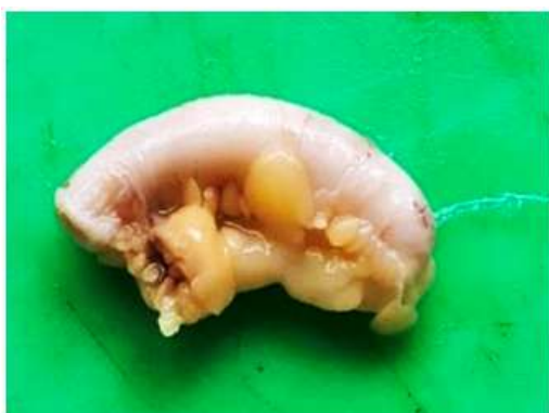
Fig. 1: Gross specimen of acute appendicitis.