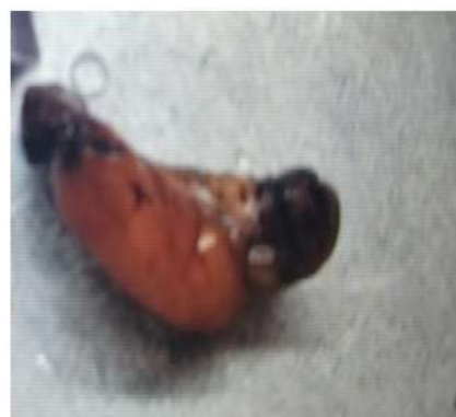
Fig. 2: Gross specimen of acute appendicitis with gangrenous change.