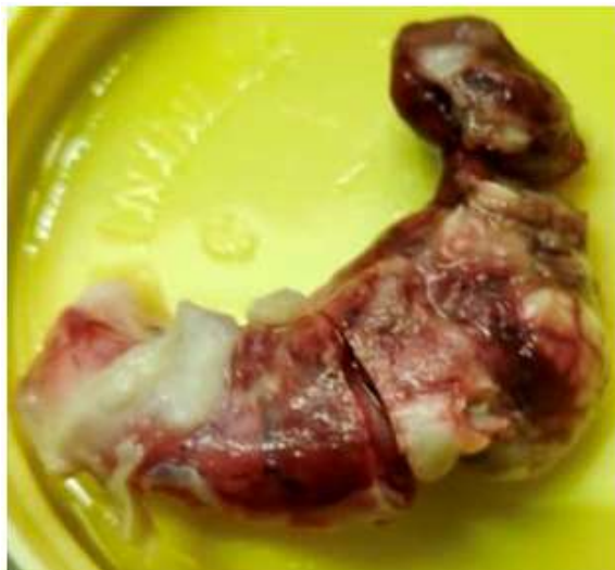
Fig. 4: specimen of appendix inflamed with gangrene and perforation.