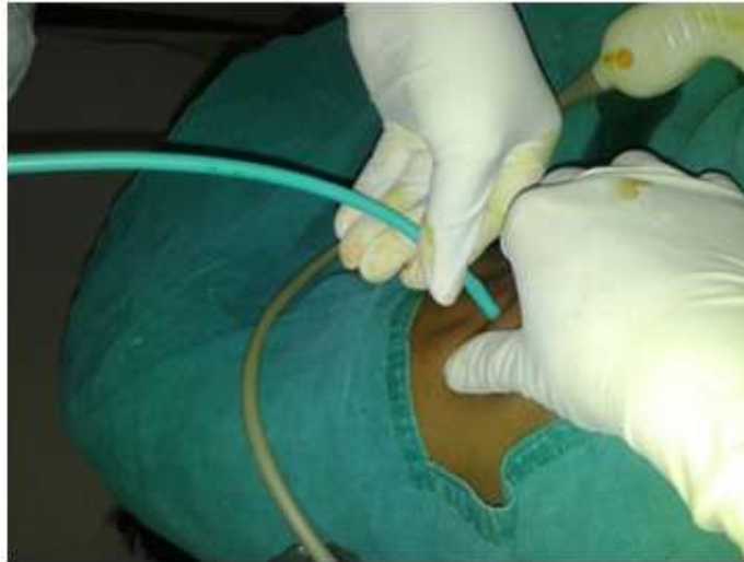
Fig. 3: USG guided pigtail catheterisation of liver abscess.

Therapeutic aspiration reserved for the following cases where: Size of abscess is more than 5 cm in diameter (125 ml). When pain and fever persist for more than 3 to 5 days after starting Antiamoebic therapy. Four clinical variables-abdominal pain, fever, anorexia, and hepatomegaly-were assessed on first, fourth, and 10 th day. Hematological (ESR, and total and differential counts) and biochemical studies (serum aspartate and alanine aminotransferase activities, and alkaline phosphatase activity) were carried out in all patients on first, fourth, and 10 th day. A raised ESR rate of more than 30 mm in 1 st hour, total leukocyte count of 12.0 \times 10^9/l , serum alkaline phosphatase activity of more than 13 King Armstrong units and aspartate aminotransferase activity more than 40 U/l were considered abnormal and successful outcome was marked by a normalization of these variables. The patients were asked to visit for reassessment once a month for 3 months. Each treatment modality studied separately for the proportion of patients with successful outcome under each category were calculated, Chi-square test, Fishers, t -test and ANOVA tests were applied.