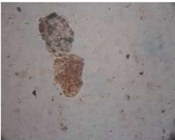
Fig. 1: E. Histolytes, iodine stain showing trophozoites.

After obtaining clearance and approval from the institutional ethical committee, patients fulfilling the inclusion/exclusion criteria were included in the study, after obtaining informed consent. Detailed history of all patients is taken with thorough clinical examination; required Investigations were done. After establishing diagnosis, Tab. Metronidazole 800 mg TID or Inj. Metronidazole 500 mg IV TID treatment was initiated from day of admission, in case of secondary infection; antibiotics (Fluroquinolones or 3 rd Generation cephalosporin's) were added in the treatment (Figs. 1,2,3).