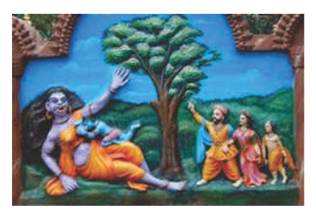
Fig. 7: J. Poison Damsels: Opium's toxicity for infanticide

Lullabies are soothing songs in rhymes, for making the infant sleep, by their babysitters, mostly.