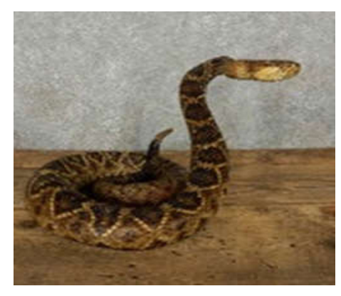
Fig. 3: Diamondback Rattlesnake (American Viper) rattlesnakes were brought into the courtroom during the trial.

Status: Executed by hanging at San Quentin State Prison in California on May 9, 1942.<sup>14</sup>