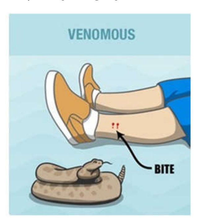
Fig. 4: Vertebrate Bites predator paralyses prey painlessly, All P's Mnemonic for easy recall.

It's both ways paralyses you, either the vertebrate snake, bites you, or, you take a bite on vertebrate frog.