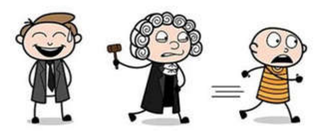
Fig. 6: Judges, Lawyer & Culprit.

Its common medicolegal argument taken by lawyers in defence, for injury caused by dangerous weapon, which the victim, fell on the weapon accidently, and it's not intentionally caused by the accused.