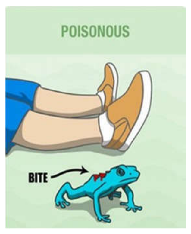
Fig. 5: It's both ways paralyses you, either the vertebrate snake, bites you, or, you take a bite on vertebrate frog.

All I's for Easy Recall: Invertebrate Irritates (I-I) Invertebrate (Arthropod) Stings = Irritants / Stimulants to vital centres of the victim