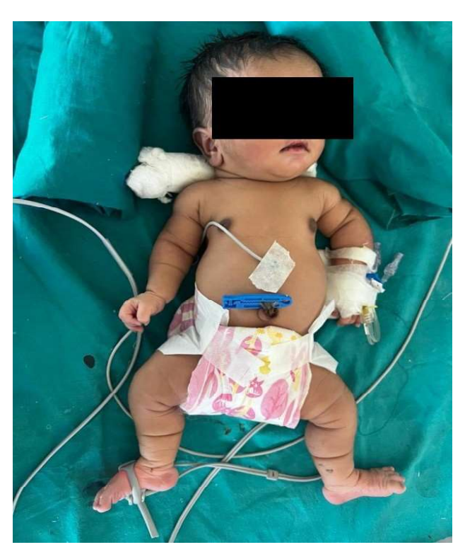
Fig. 1: Shortening of limbs, large head with frontal bossing, flat nasal bridge and protuberant abdomen.

The baby was admitted for 2 days till feeding was established and the parents were confident enough and then was discharged.