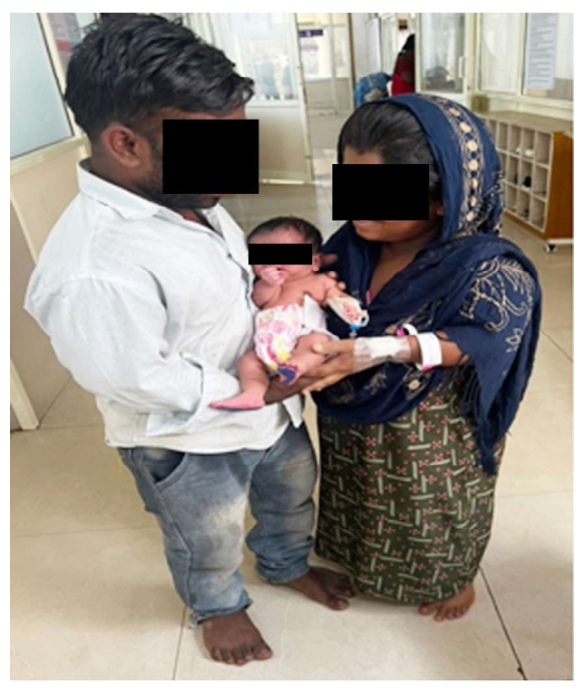
Fig. 2: Happy parents with the baby