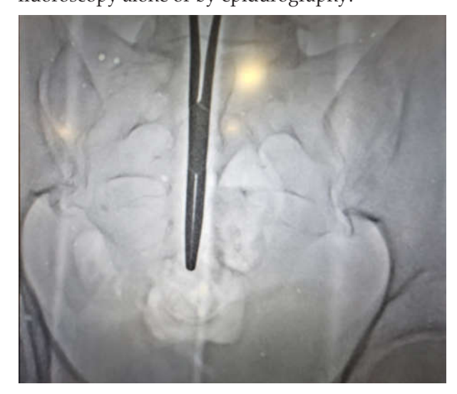
Fig. 1: Fluoroscopic Position And View Anterior-Posterior

Epidural injections of local anaesthetic agents and corticosteroids are widely used to provide symptomatic relief in patients with low back pain due to lumbar radiculopathy.<sup>3</sup> These injections can be approached by trans laminar, transforaminal, and caudal routes. Caudal epidural injection is considered as semi-invasive procedure and allows sufficient proximal spread of medicine Fluoroscopy is most commonly used in interventional spine procedures and is frequently used in confirming the location of tranforaminal and caudal epidural needle.<sup>4</sup> It has been advocated that caudal epidural needle placement should be confirmed by fluoroscopy alone or by epidurography.<sup>5</sup>