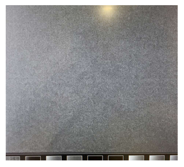
Fig. 2: Fluroscopic Lateral View - Blurred due to High Body Mass Index