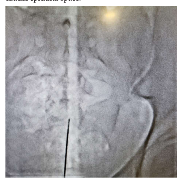
Fig. 4: Fluoroscopy Guided Confirmation of Needle Position and Dye Spread

In this case initial tranforaminal injection attempts were failed because of inadequate visualisation in later view fluoroscopy images because of patient high body mass index. Hence we decided to convert procedure into combined fluoroscopy and ultrasound guided hybrid caudal epidural. With help of high frequency curvilinear ultrasonography probe sacral hiatus was identified and proceeded with caudal epidural.6 With fluoroscopy anterior posterior view guidance needle was advanced till lower S3 vertebra and needle position confirmed. Dye spread confirmed and pre made steroid local anaesthetic mixture is given. Perhaps the only disadvantage with ultrasound is the fact that it cannot provide us with the image information as to the depth of the inserted needle. Ultrasound waves cannot penetrate the sacral bone to observe the hyper echoic caudal epidural needle inside the caudal epidural space.7