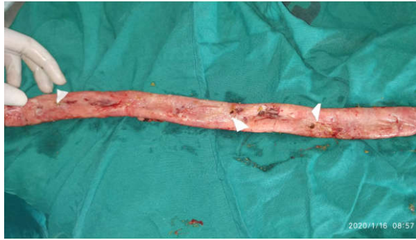
Fig. 2: Picture showing resected segment of ileum with multiple perforations.

general hospital Gulbarga, from October 2018 to January 2020. A thorough history was taken and detailed examination done as per proforma. Investigations included cbc, Serum. Electrolytes, Random blood sugar, Renal function test, Chest x ray, X ray Erect abdomen, USG abdomen, Widal test.