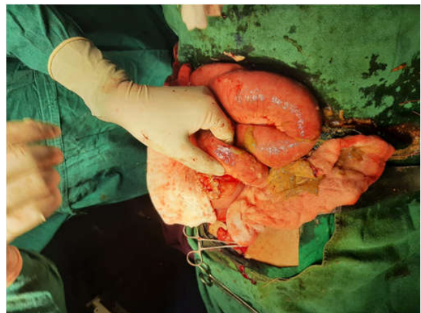
Fig. 1: Intraop picture showing multiple ileal perforations with fecal matter spillage.

Present study was a prospective interventional study, conducted at Basaveshwar teaching and