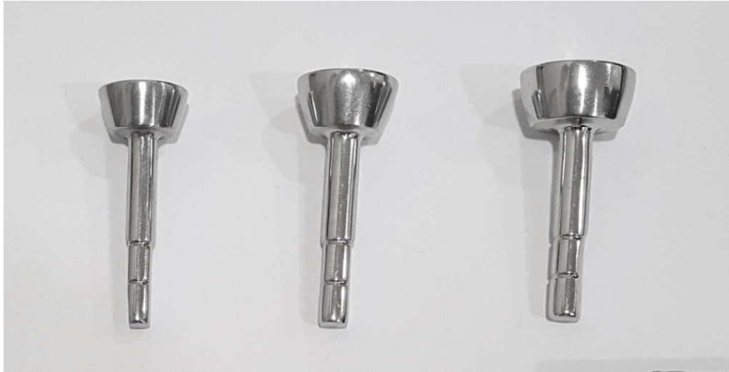
Fig. 1: Different sizes of metallic mono-bloc prosthesis for radial head.