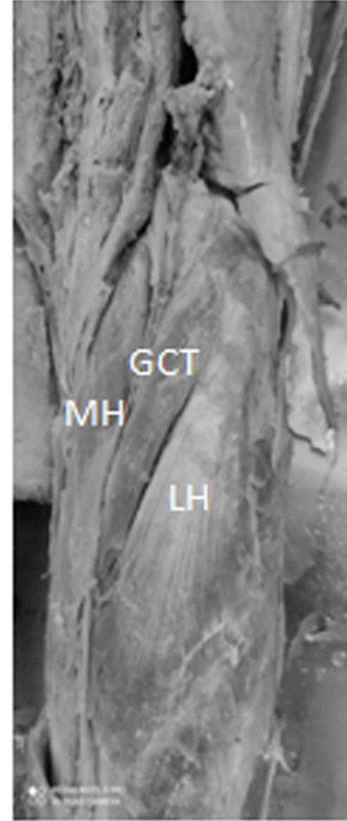
Fig. 2: Shows the Gastrocnemius Tertius muscle in the right side of the case. LH - lateral head of the Gastrocnemius muscle; MH - Medial head of the Gastrocnemius muscle; GCT - Gastrocnemius Tertius.