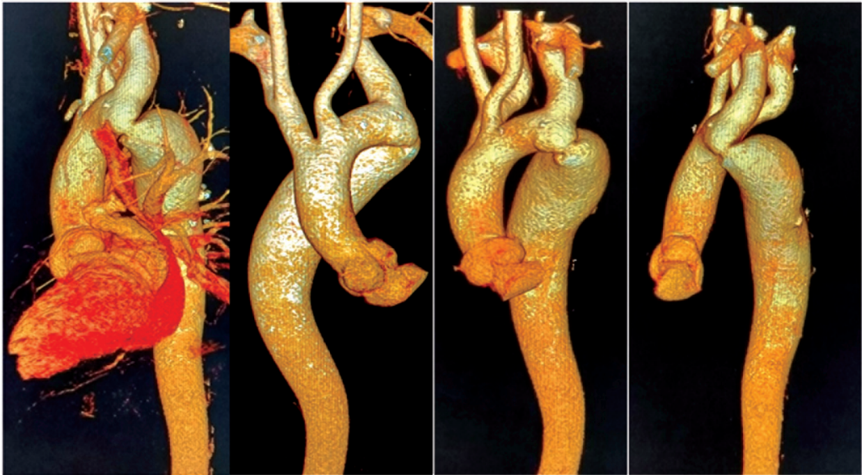
Coarcted segment and Post stenotic dilation