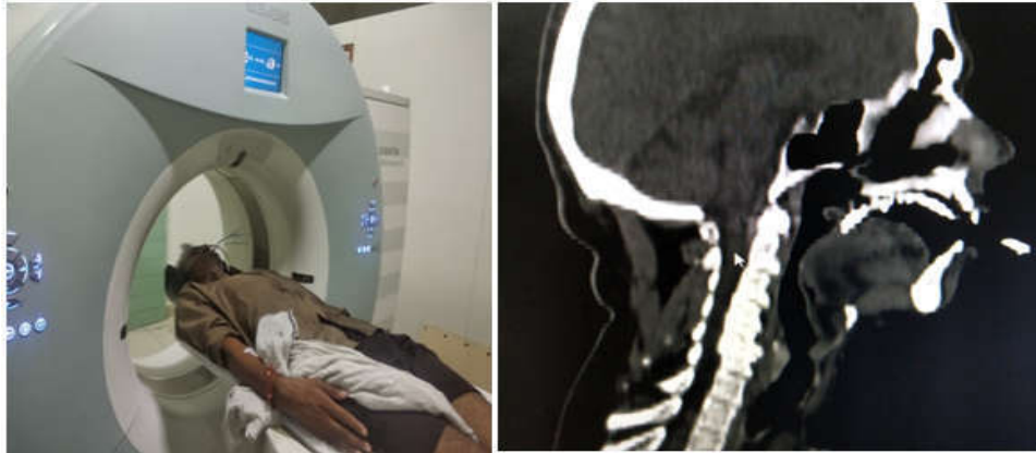
Fig. 4: (a) Patient undergoing CT simulation with mould carrier in situ, b) Sagittal view of CT scan showing no air gaps