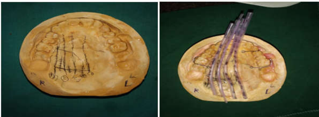
Fig. 2: (a) Markings of the carrier tubes on the cast, (b) Infant feeding tubes assessment