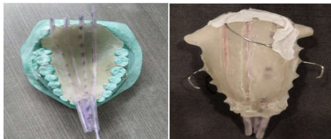
Fig. 3: (a) smaller tubes inside larger tubes, (b) Disease being marked by lead wire on the carrier mould