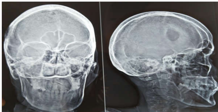
Fig. 3: A plain radiograph of skull showing skull bone erosion of outer skull table with impending erosion of inner table.