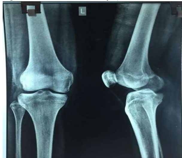
Fig. 3: Plain radiograph of left knee (AP and lateral view): grossly normal.