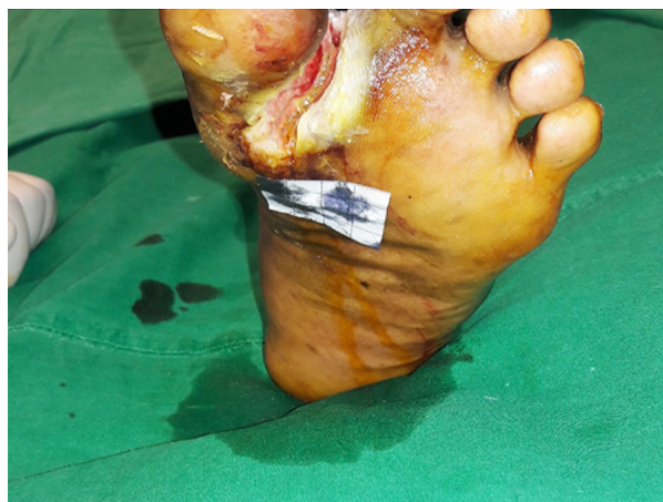
Fig. 3: Ulcer showing Granulation