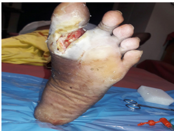
Fig. 2: Ulcer first web space