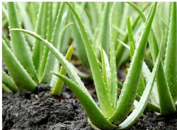
Fig. 2: Aloe Vera plant