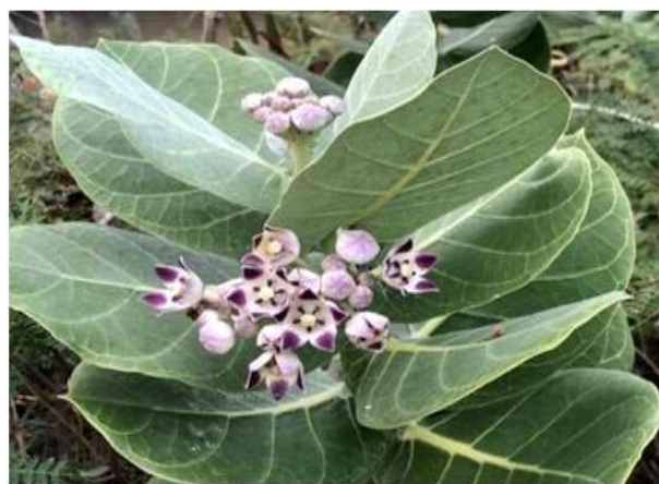
Fig. 4: Calotropis procera plant