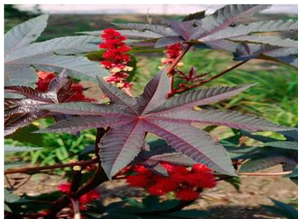
Fig. 3: Ricinus communis plant