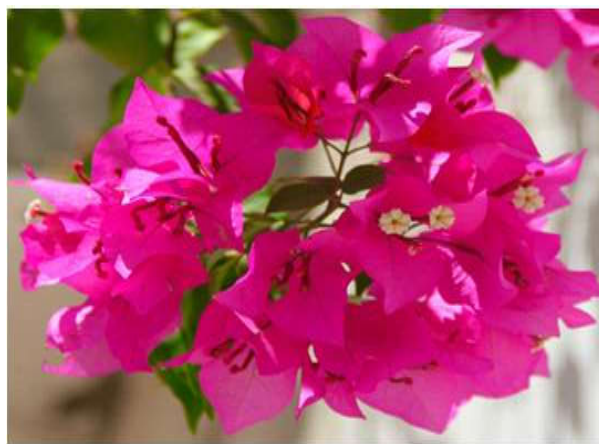
Fig. 5: Bougainvillea glabra Flower.