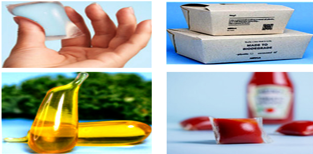
Fig. 7: Edible/biodegradable packaging products