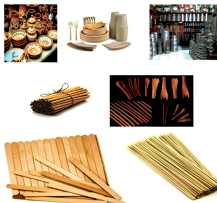
Fig. 2: Plastic Policy 2022 Government of India