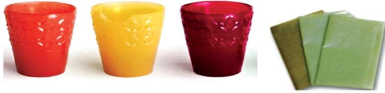
Fig. 3: ElloJello edible cups and packaging