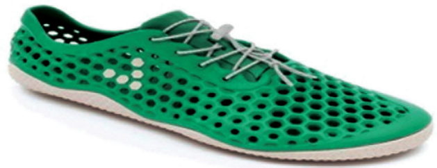
Fig. 4: Shoe products using Bloom algae foam