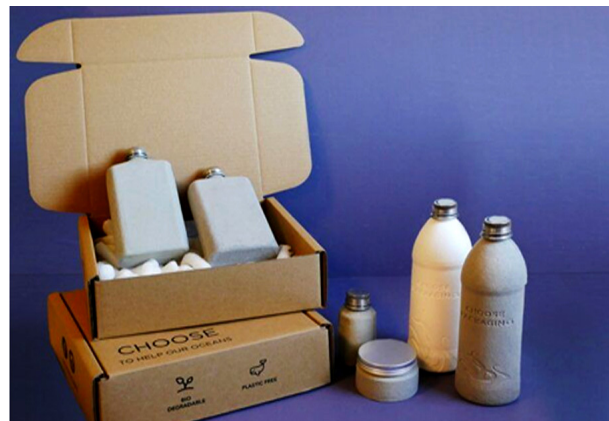
Fig. 6: Zero plastic paper packaging bottle

A UK firm has invented the only commercially available zero plastic recycled paper bottle in the world. From seal packing to the inner lining of the bottle, everything is made from a sustainably