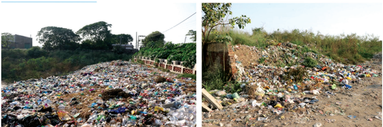
Fig. 1: Plastic Hazards

While environmentally friendly biodegradable plastics are a desirable solution, it is essential that they also fulfill required functional performance parameters (i.e. moisture barrier, heat sealability). The Indian plastics industry started in 1945 and has been growing over the years. From 0.9 million tons in 1990 to 18.45 million tons in 2018, plastic consumption has grown 20 times since then. 3