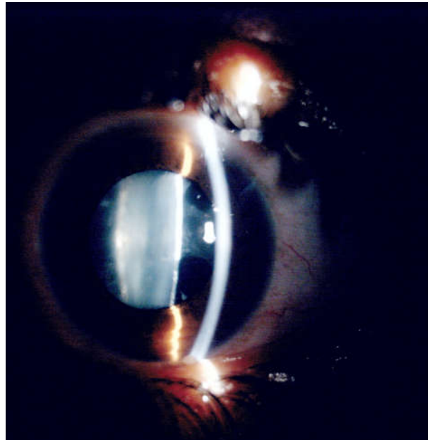
Fig. 3: Anterior and posterior subcapsular cataract