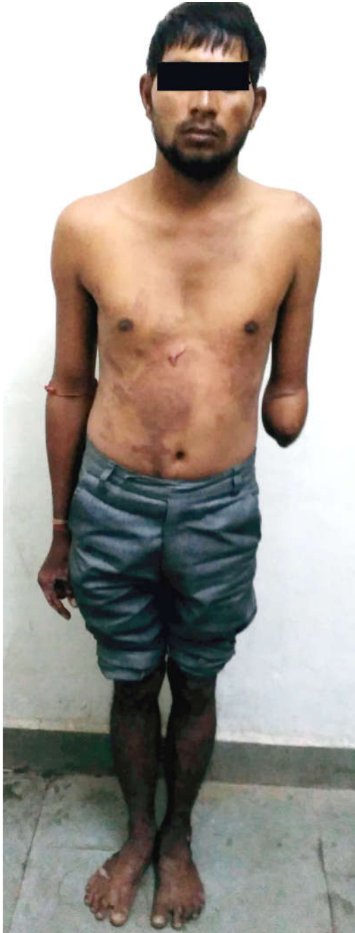
Fig. 1: Amputated left hand and arrow showing exit wound

On review 3 weeks later, his best corrected visual acuity is 6/6, N6 in left eye.