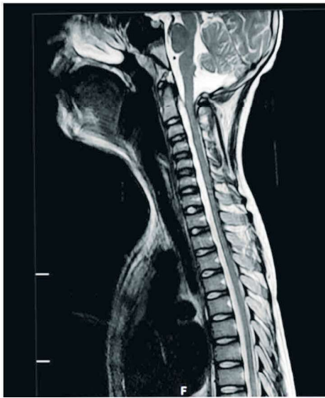
Fig. 1: MRI Sagittal view showing anterior epidural collection with layering extending from C2 to D8 level causing posterior displacement and compression of cervical and dorsal cord likely due to haemorrhage.

and temperature of 99 degree F. Single breath count (SBC) was. 8 General examination revealed deep icterus. Cardiovascular examination and chest auscultation were unremarkable and abdomen was soft. On neurological examination he was conscious, irritable but obeying commands. Pupils were bilateral 2mm reacting to light, no nystagmus, normal fundus, no facial weakness and other cranial nerves examination was grossly normal. He was unable to lift his neck against gravity, power in all 4 limbs was grade 1/5 with hypotonia and deep tendon reflexes were absent with extensor plantars. Sensory level was appreciated at T5/T6 level and patient had urinary retention.