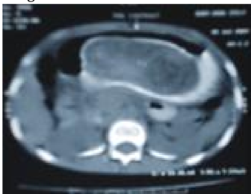
Figure 1B: Trichobezoar in Ileum