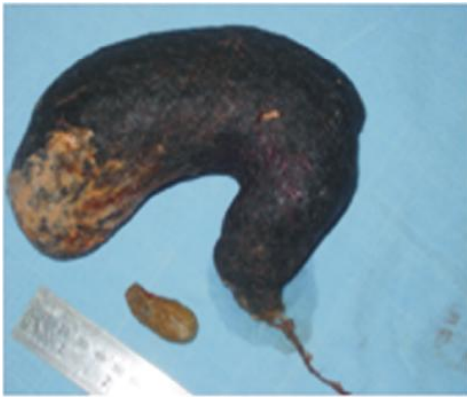
Figure 3: Both Specimens

as in our case, has been rarely presented in the literature. Trichobezoars commonly occur in adolescent females with a preceding history of trichotillomania (pulling of hairs) and trichophagia (hair swallowing). Trichophagia occurs in up to 18% of patients with trichotillomania, and one-third patients with trichophagia develop trichobezoar.[7-9] Although the exact cause of trichotillomania is not clear but certain theories are proposed which say that psychosocial, behavioural and biological factors lead to this condition.[10,11] Majority of the cases of trichobezoar present late due to low index of suspicion. Of 131 reported cases of trichobezoar, a palpable mass was found in 87.7%, abdominal pain in 70.2%, nausea and vomiting in 64.9%, weakness, weight loss in 38.1%, constipation and/or diarrhea in 32% and haematemesis in 6.1%.[12]