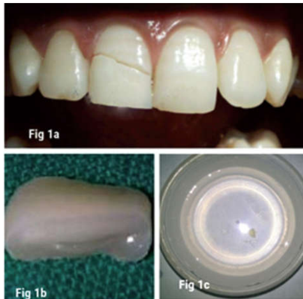
Fig. 1(a) Ellis class III # 11 Clinical picture, (b) Fractured fragment separated from tooth (c) Fractured segment stored in Normal Saline.

fractured fragment was attached to the crown but was grade II mobile. Radiographic examination revealed horizontal crown fracture of maxillary right central incisor with pulpal involvement (Fig. 2(a)). According to clinical and radiographic examination diagnosis of Ellis Class III fracture was confirmed, and treatment plan of reattachment of fractured segment using fiber post and dual cure resin was planned.