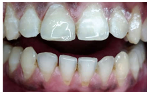
Fig. 3: Post operative clinical Photograph after cementation.

was removed (Fig. 1(b)) and stored in normal saline (Fig. 1(c)) to be used at a later stage. Isolation was achieved using rubber dam, and saliva ejector placed in position. Root canal treatment was completed immediately using sectional technique, and the post space was prepared (Fig. 2(b)). A light-transmitting fiber post was tried in the canal and cut at the desired length (Fig. 2(c)). The fractured fragment was removed from the normal saline and tried on the cut end of the fiber post. Remnants of pulp tissue from the fractured fragment were removed during this step. Care was taken not to remove excess dentin, because it can alter the final esthetic appearance of the tooth. Once the desired fit was confirmed, it was stored in distilled water.