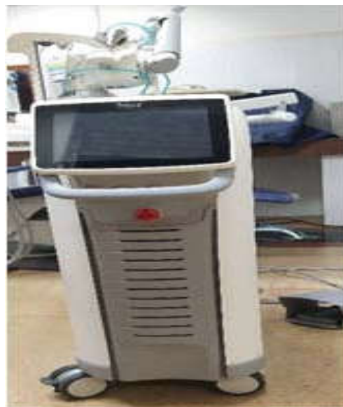
Fig. 3: Fotona sky walker, IMS, BHU (funded by DST, New Delhi)

Caries removal and tooth preparation can be done easily using this laser, 20 while protecting the sound tooth structure; 21 increased water content in decayed part allows laser to interact only with diseased tissue. 22,23