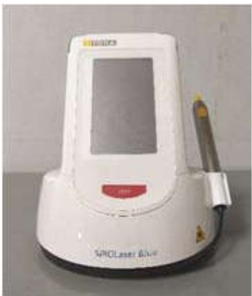
Fig. 2: SIROLaser Blue, FDS, BHU

In addition to surgical lasers, these are used for manufacturing of devices like Diagnodent, which uses visible red diode at 655 nm wavelength and 1mW power. This red energy excites fluorescence from carious tooth structure, which when reflected to detector in the device, analyses and quantifies the degree of caries. 13