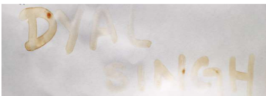
Figure 1: Apple juice after treating at hot plate