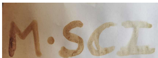
Figure 4: Detergent after treating with iodine fuming