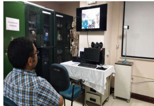
Fig. 4: On going video-conferencing.