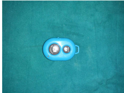
Fig. 2: Bluetooth remote for operating the mobile device.