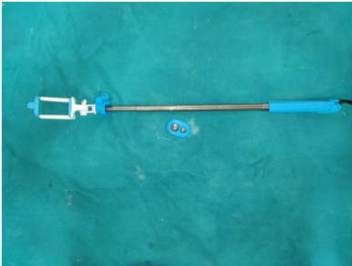
Fig. 1: Selfie stick with detachable tripod stand and Bluetooth.

Feedback was obtained from users based on a