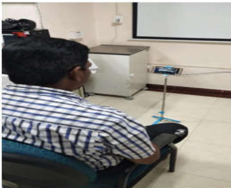
Fig. 3: Selfie stick with tripod.